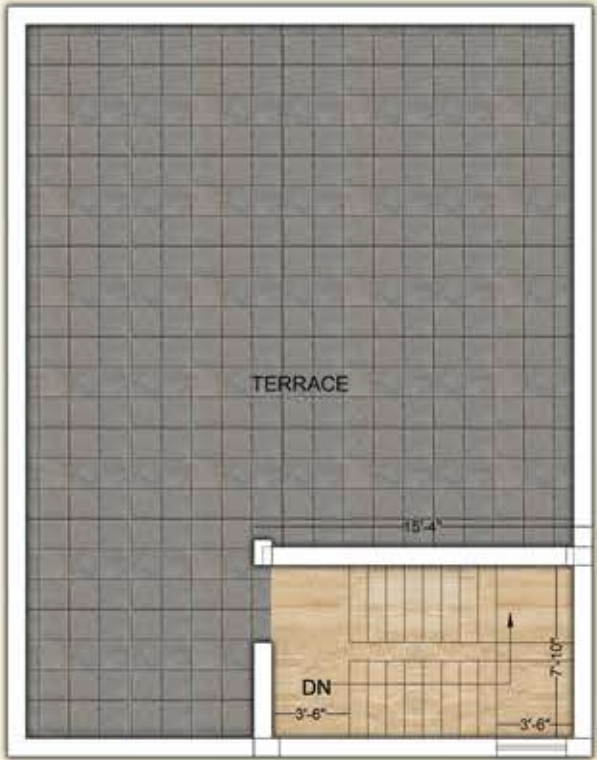
TERRACE FLOOR PLAN (TYPE-A ). SUB PLOT No :-1,2,3 & 4 BUILT UP AREA:- 146.00 SQFT