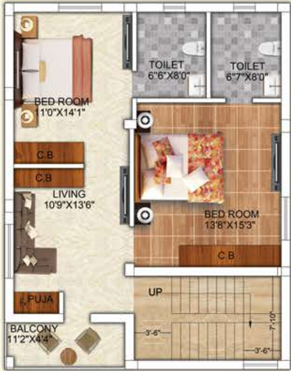
FIRST FLOOR PLAN (TYPE-A ). SUB PLOT No :-1,2,3,4 & 5. BUILT UP AREA :- 901.00 SQFT.