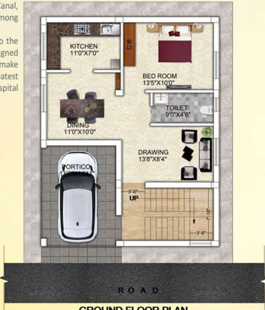
GROUND FLOOR PLAN . BUILT UP AREA :- 901.00 SQFT. PLOT AREA :- 1028.00 SQFT. SUB PLOT No :- 1,2,3&4.